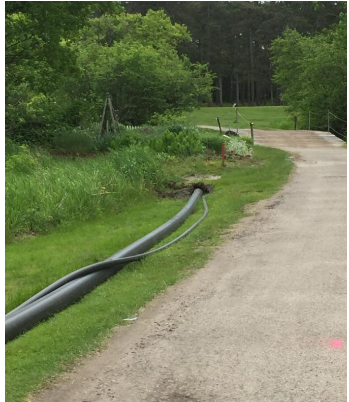
Directional bore of the River

Holes 1, 9 15, 18 and the putting green have been flagged for installation of the lateral pipe and sprinklers.