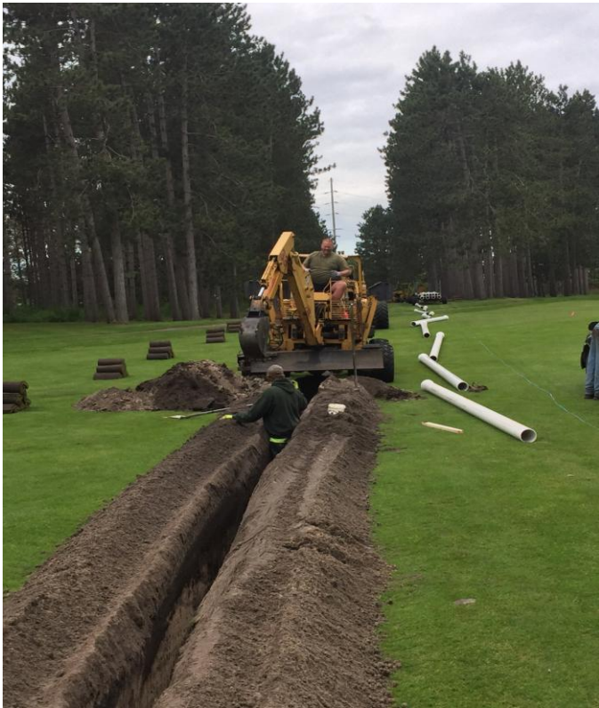
Installation of the Main Line pipe on Hole 12

In addition to the main line work, the lateral pipe and sprinkler heads have been installed in the practice hole, the range tee and the parking lot triangle to the left of 9 green. Connection of the new irrigation system to the baseball diamond irrigation is also complete.